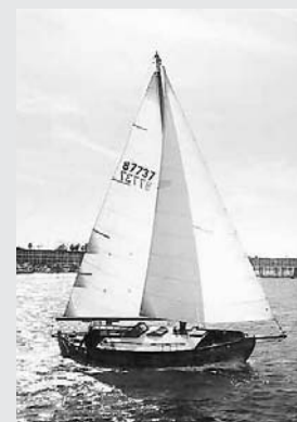
The Richmond II.